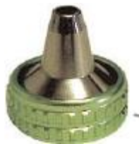
Glazing gun air cap