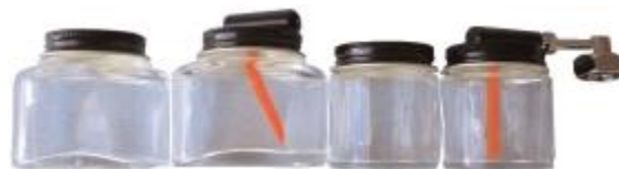
61-2104J To be used with rule #40CFR-6H